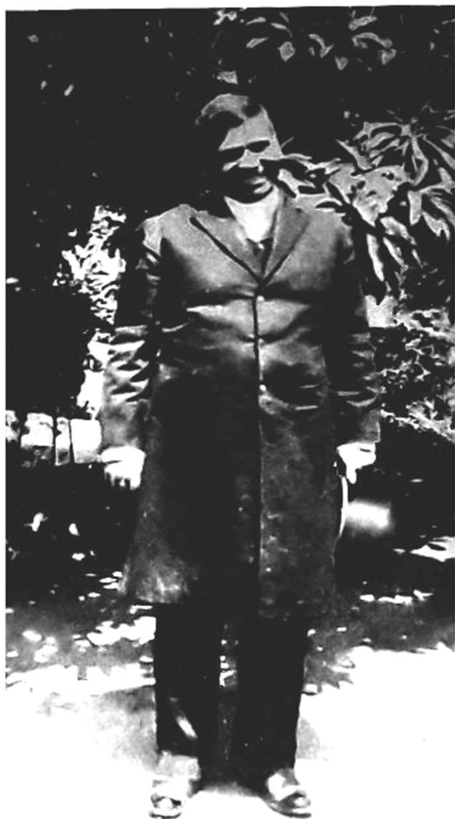
Swami Trigunatitananda in San Francisco