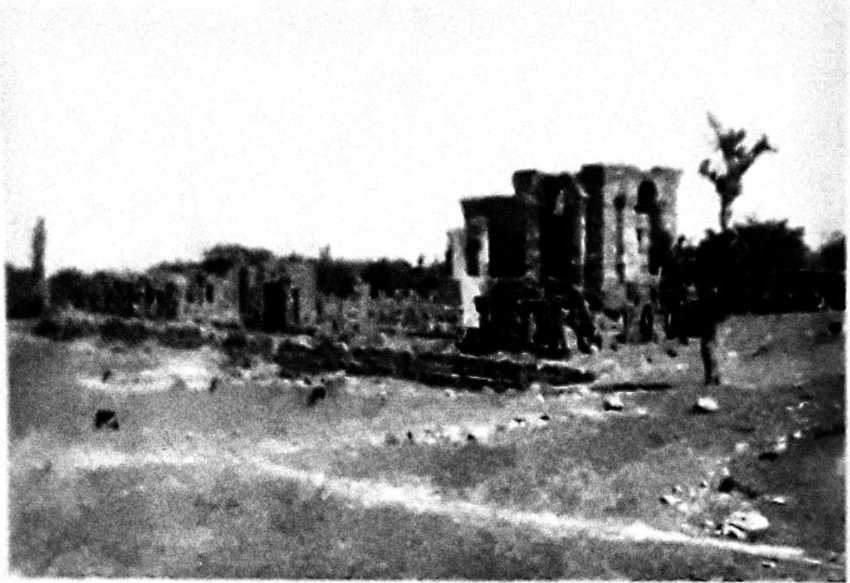
The Martanda Temple as it stands today.