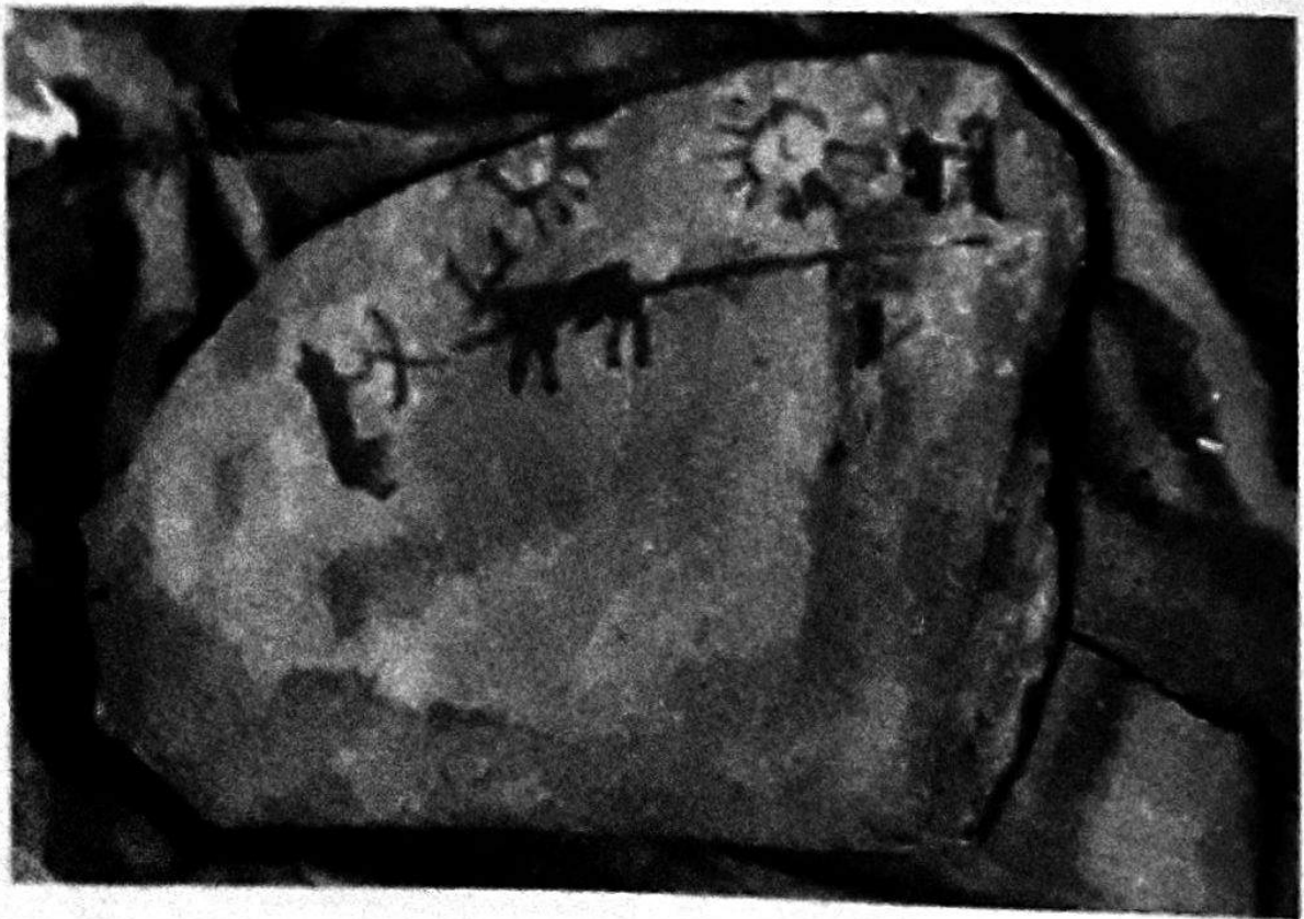
Burzahom : hunting scene showing carving of two suns with radiating rays at the top.