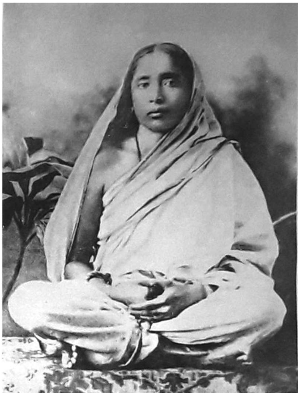
The Holy Mother, Sri Sarada Devi, at fifty-two