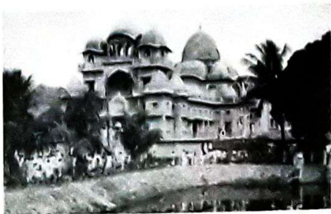
Crowds collected on Sri Sarada Math grounds on 6.11.81.