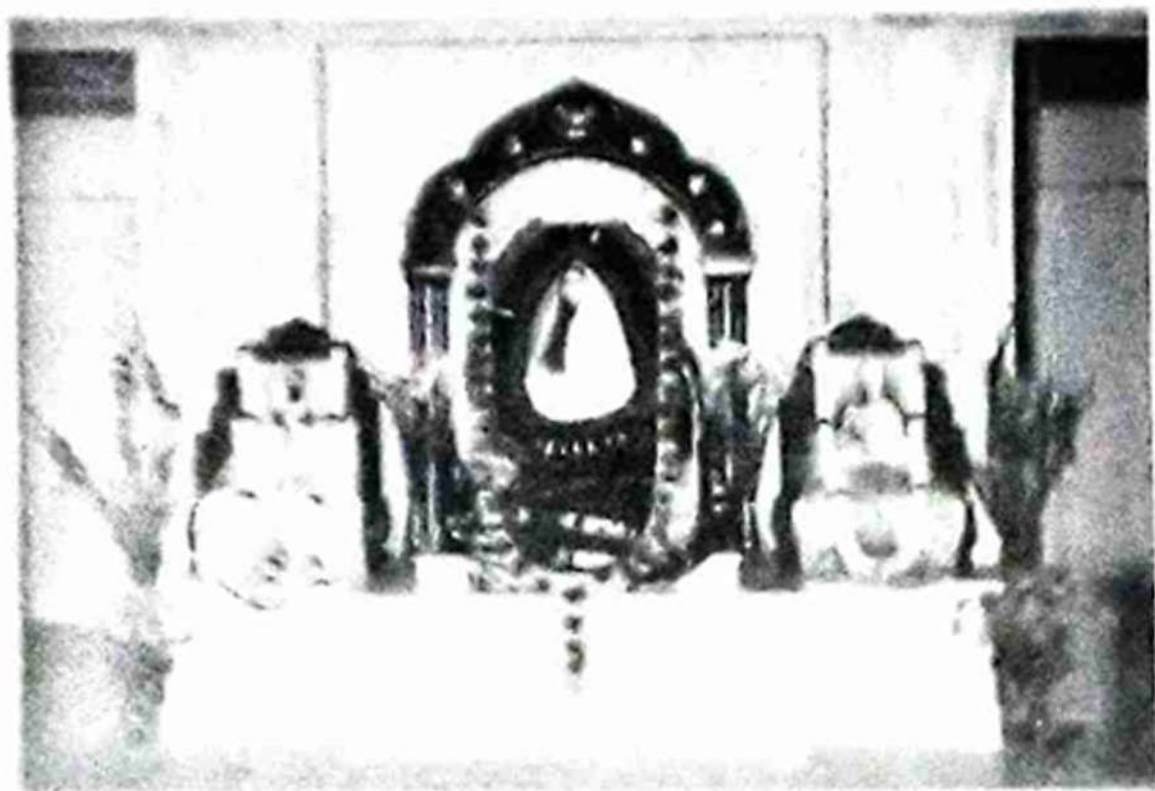
Altar of the Shrine in the New Temple