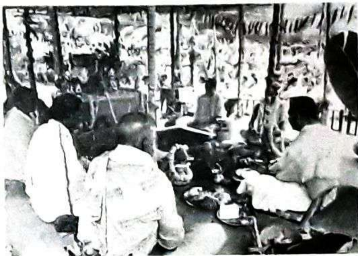
The Pandits doing Sapta-Shati-Homa in the Yajna-mandapa on 6.11.81.